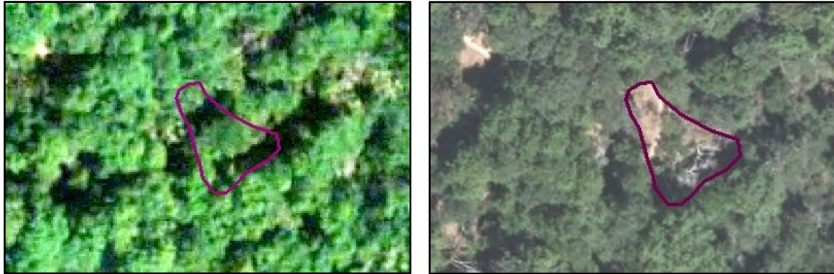
Figure 2: Complete cycle from 2009 (image on left) to 2014 depicting unaffected coast live oak to a fully downed tree in 2014. In this example the SOD 2014, 2014 Hardwood Change and Total Gap fields are all assessed since all events occurred after the 2009 imagery was created.

When SOD was noted in stands that affected coast live oak, the diseased trees felled relatively quickly, usually creating a gap within a 5-year span. In many examples, living coast live oaks were seen on the 2009 imagery that were completely downed by 2014, resulting in a gap in the stand that contained only the larger branches of the downed tree. Standing dead coast live oak trees were rarely seen on the 2014 imagery, but when they were encountered, they were inventoried as part of the dead vegetation modifier (SOD2014) instead of the gap. The gaps that were created from dead coast live oak were frequently sparsely vegetated, with little to no new shrubs or trees regenerating in the location. This resulted in a loss of hardwood within the polygon. (See Figure 2 below)